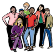
Youth in the Digest!

The Sr. High Youth here at Divinity are a month into this year's activities and already they have been involved in several activities in which they are discovering new and interesting ways to glorify God,